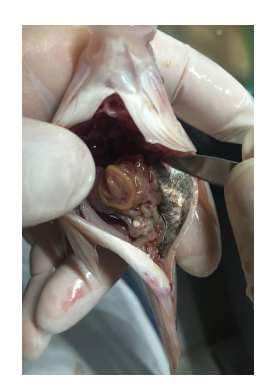
Picture 30: As a standard post vaccination control check for adhesions. In these pictures some expected local effects as adhesions and vaccine residues are seen