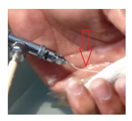
Picture 22: Withdrawal of the syringe before the whole vaccine dose has been injected will result in insufficient amount of vaccine in the fish