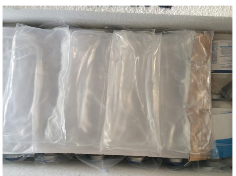
Picture 5 and 6: Vaccine at the site: protect from high temperature and direct light. Picture 5; vaccine is not adequately protected