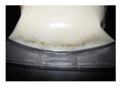
Picture 2 and 3: Normal appearance of vaccine. Picture 2: Homogeneous. Picture 3: Oily layer on top, must be shaken before use. Picture 4: Separated vaccine with clear water droplets - DO NOT USE