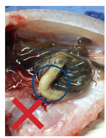
Picture 23: Incorrect vaccination – injection in muscle (left) and injection in gut (right). May be caused by incorrect injection angle, short or blunt needle, depositing while inserting or withdrawing the needle or poorly anaesthetized fish