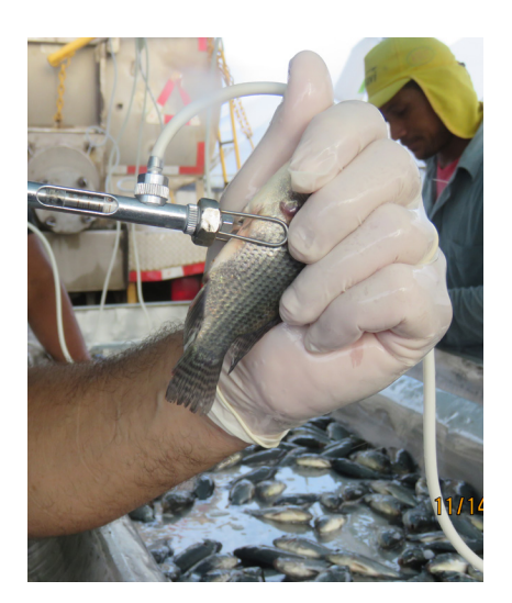
Picture 19: Correct vaccination: With guard, good gloves, gentle but good grip, minimal pressure on fish